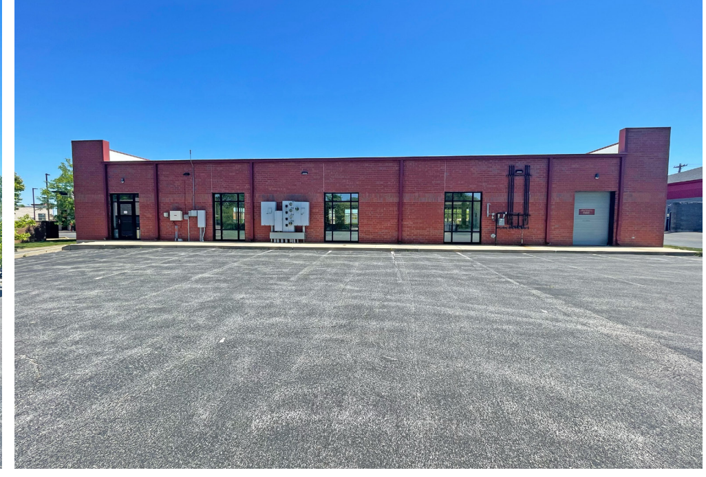
Additional Parking Behind Building